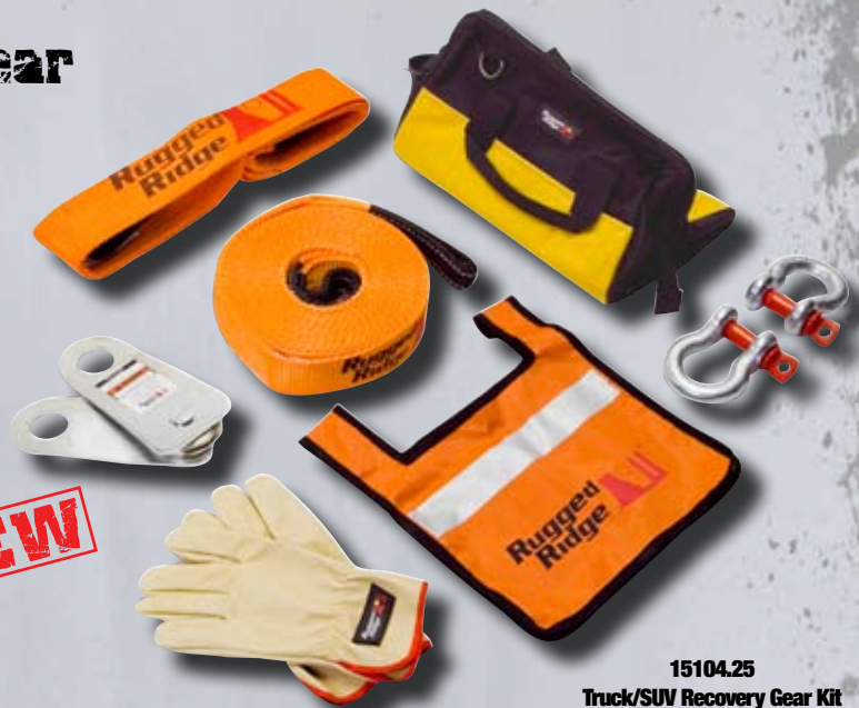
15104.25 Truck/SUV Recovery Gear Kit